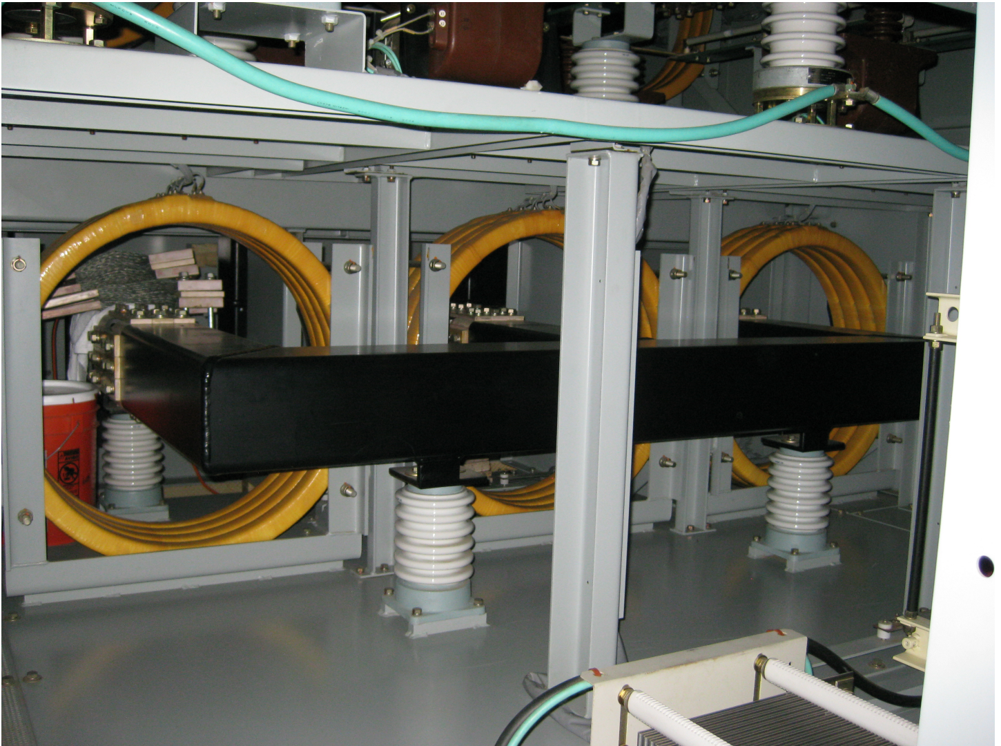
Neutral End of Windings with CTs