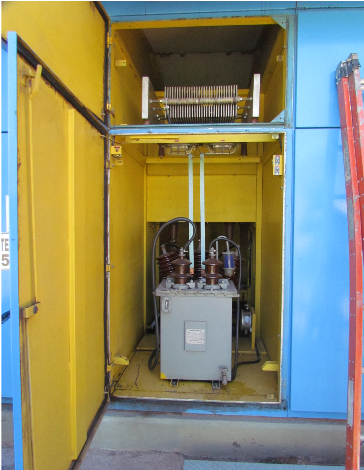
Neutral Grounding Transformer and Neutral Ground Resistor