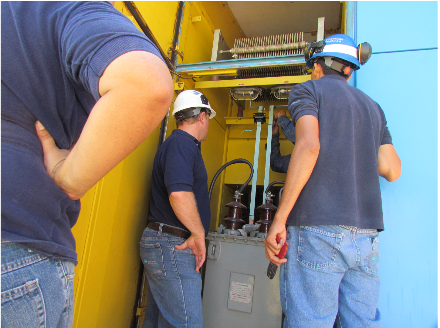
Second picture with people to show relative size