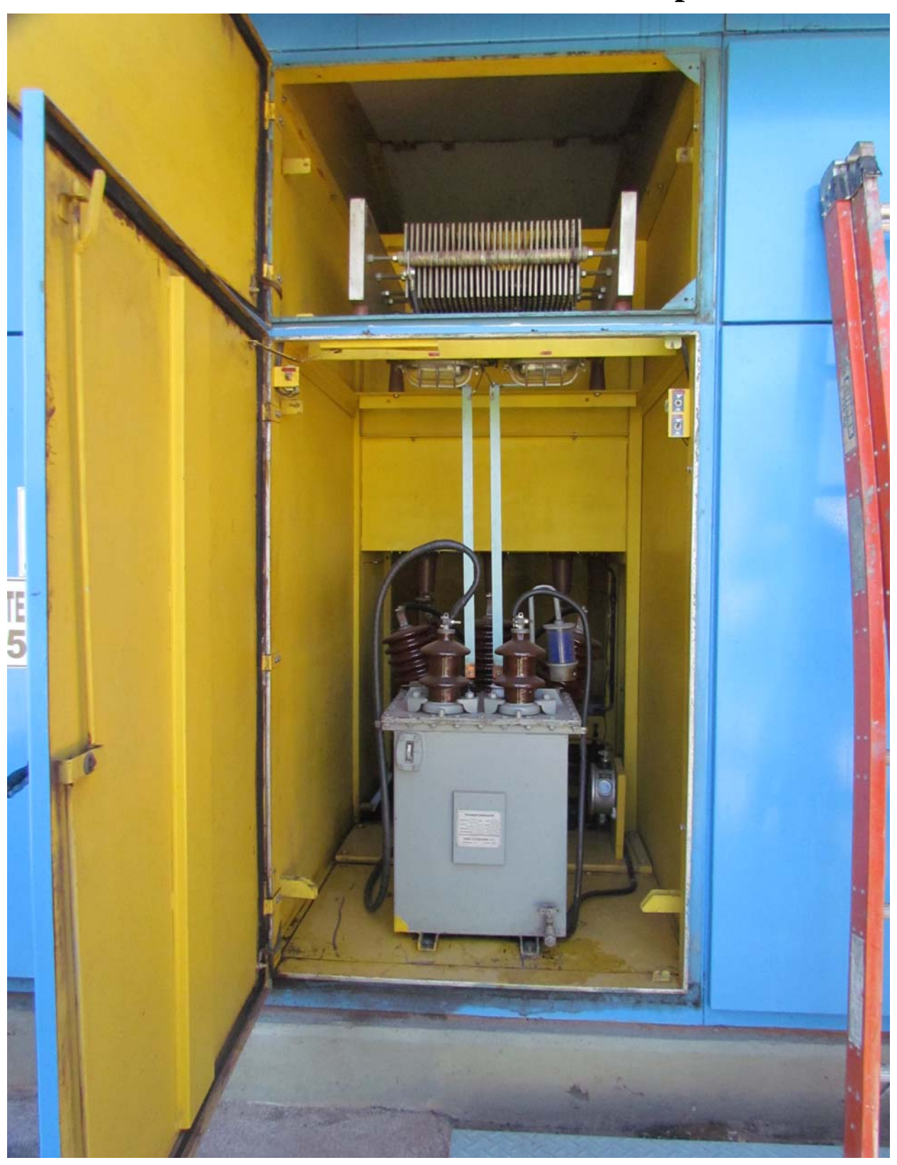
Neutral Grounding Transformer and Neutral Ground Resistor