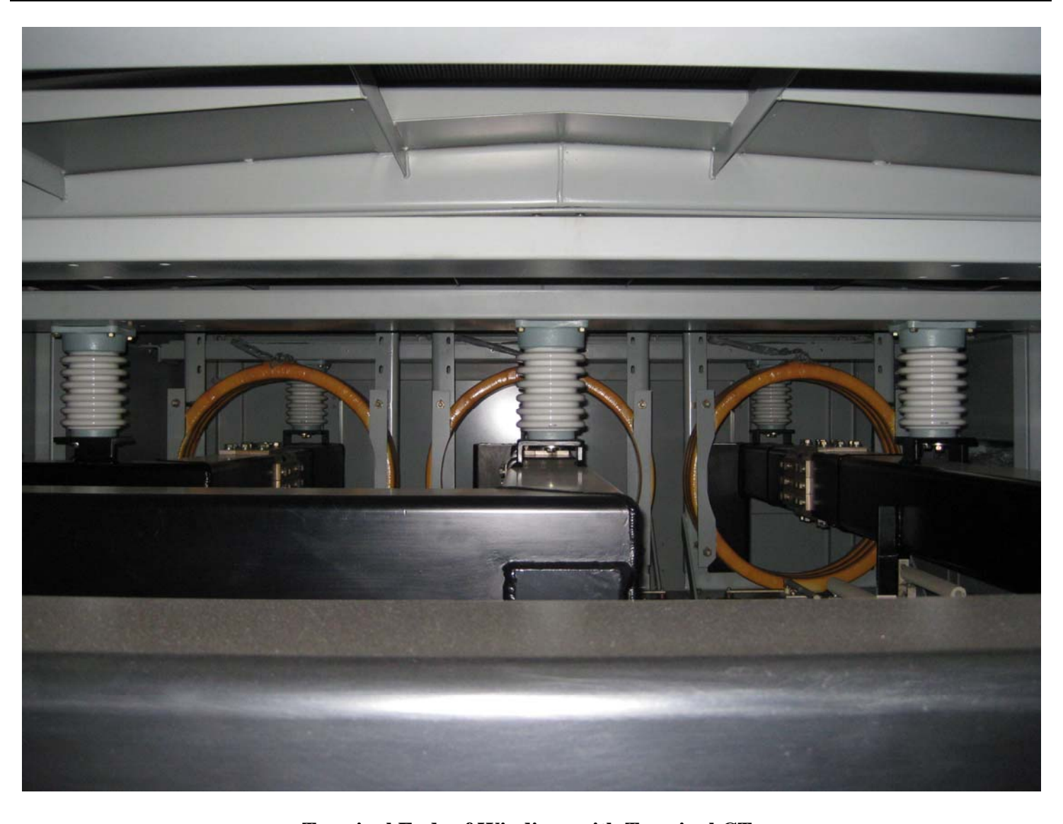
Terminal Ends of Windings with Terminal CTs