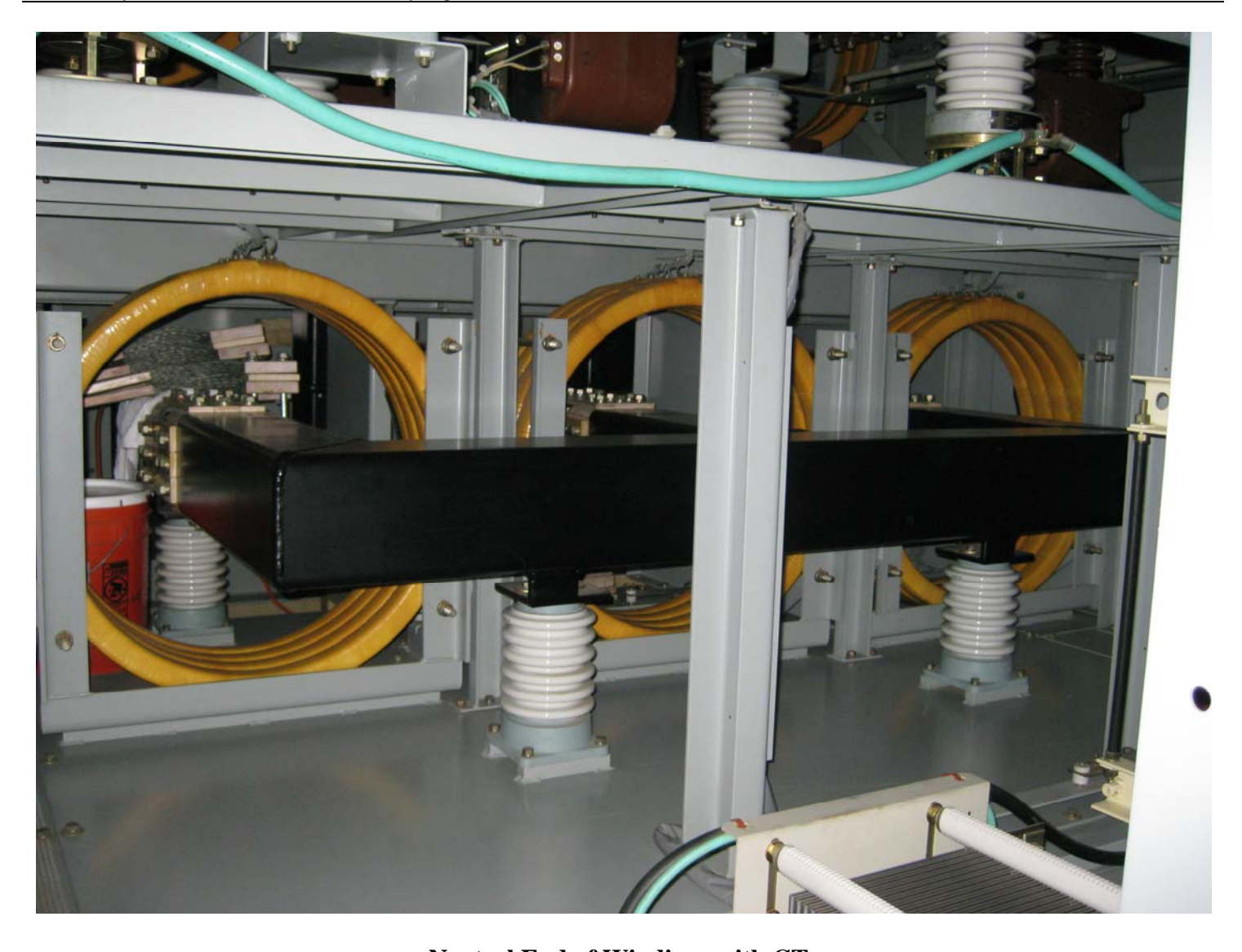
Neutral End of Windings with CTs